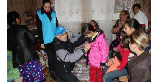
With onset of winter, UNHCR distributes warm clothing to the most vulnerable IDPs, including children

Collective centres: The rehabilitation of collective centres in Kharkiv, Luhansk, Donetsk, Dnipropetrovsk and Zaporizhzhia regions is ongoing through direct implementation or partnership with local authorities. An estimated 30,000 to 40,000 IDPs (6-7 per cent of total IDP population) are currently accommodated in collective centres, where the most vulnerable are often placed there as a last resort. The constant fluctuation and dynamic of the displacement underlines the need for this capacity near conflict areas. UNHCR with our partner People in Need plan to repair and make ready for the winter a further 12 collective centres in northern Donetsk and Kharkiv region. This brings the total number of premises under different stages of refurbishment to 47.