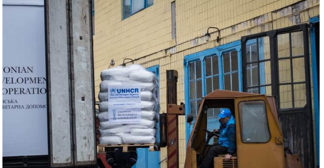
On 19 November, UNHCR dispatched food donations received from Estonian government and food producers to the collective centres in Odesa region

In late October UNHCR undertook monitoring missions to Vladivostok and Khabarovsk (far east of Russia), and Irkutsk (eastern Siberia) to observe reception conditions and integration options of Ukrainian nationals arriving in these areas. Those in possession of temporary residence permits arrive at their own expense and reside with families and friends. The majority of the refugees and people with Temporary Asylum status arrive through the centralised relocation system from the border areas and Saint Petersburg and stay predominantly in Temporary Accommodation Centres (TACs).