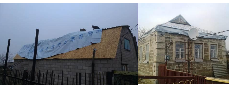
UNHCR continues to distribute reinforced plastic sheets to affected villages and towns. During the last week, despite ongoing hostilities, people in Talakovka in southern Donetsk region managed to cover the damaged parts of their homes, schools and kindergartens.